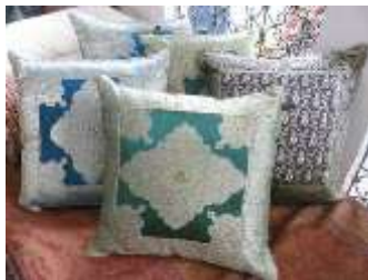
Pillows Plain Color 24X 24 $25.00