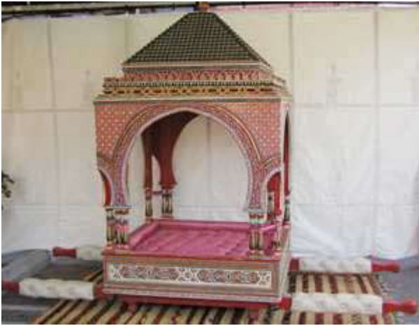
Amaria- Wedding Carriage $ 750.00