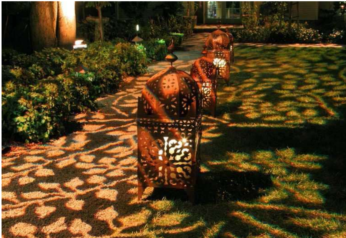
Lanterns Clear Square

KASBAH 22" $25.00 KS95 30" $39.00 KS97 39" $75.00 KS99 60" $150.00 KS100