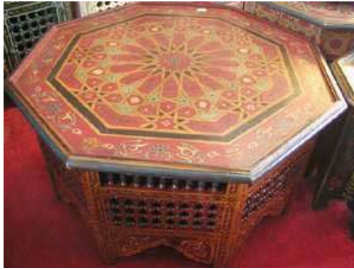
Berber hand carved table 30 "x32"xH16": $49.00 WB5