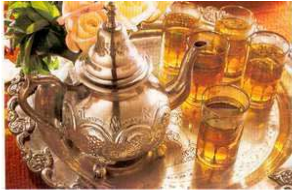
Large Tea Glasses $1.99 Could be use also for votives candles as well