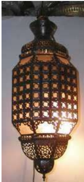
H: 26" with chain. W: 24" $ 29 .00