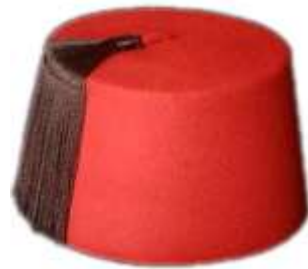
Hat Fez: $ 25 .00 (purchase only)