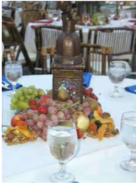
24" X 8" $29.00 Moorish clear Lanterns