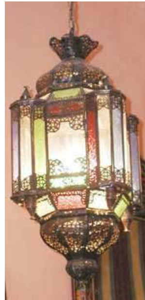
H: 26" with chain. W: 24" $ 45 .00