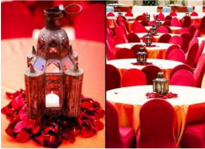
Marrakech lanterns 26" $39.00 KW06