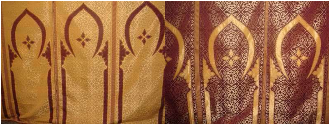
Back drop panels both sides are pictured: 6' Height x 13' wide: $ 250.00