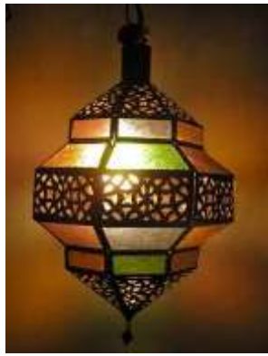
Colored Bowl Hanging Lanterns H 12" D $ 25.00