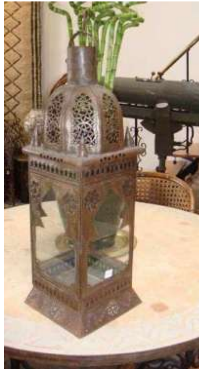
24" X 8" $29.00 Moorish clear Lanterns