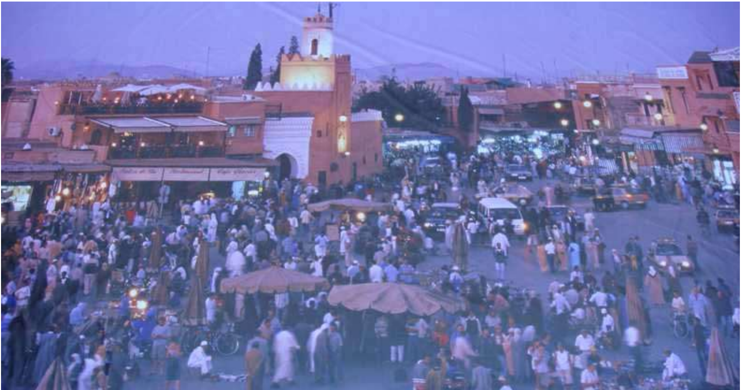
Backdrop of Marrakech Place can be use on the wall Dimensions: 22'h x 50'w Rental Price: $395.00