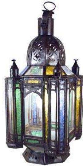
26 " x 13" $49.00 Menara-LGM1