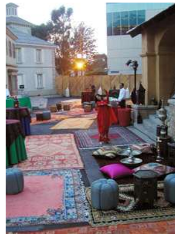
Marrakech 16 x 6 $ 350