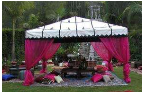
Moroccan Tent 13' x 13' $ 1,250.00 * complete With sheer fabric any color.