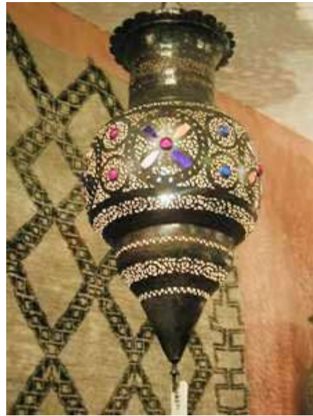
Oversized Brass Chandeliers