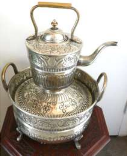
Kettle and bassin : 30" H $49.00