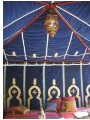
Moroccan Tent 13' x 13' $ 950.00 * Top only Moroccan Tent 13' x 13' $1,250.00* complete with walls